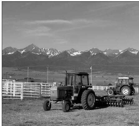
SDCEA's annual meeting took place on a gorgeous spring day in the Wet Mountain Valley.