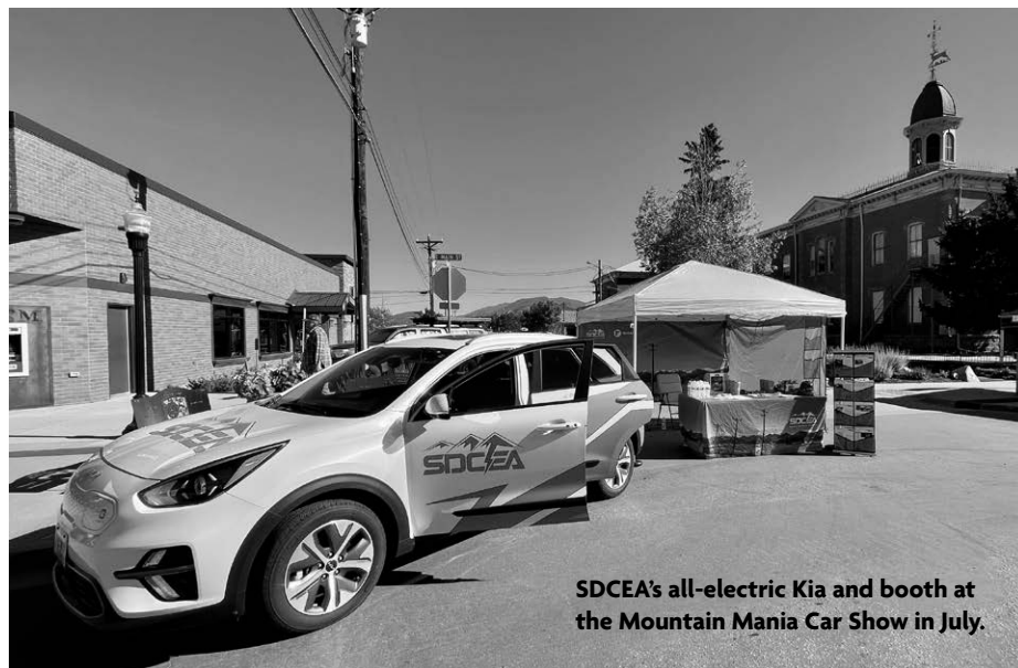
SDCEA's all-electric Kia and booth at the Mountain Mania Car Show in July.