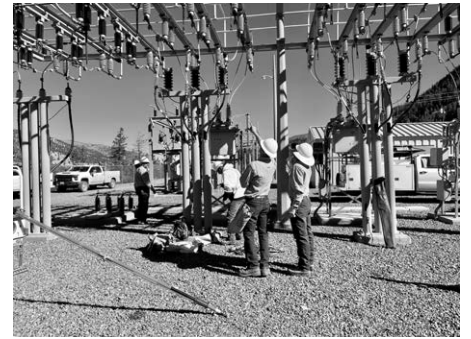
GCEA Linemen Discuss an outage in Lake City