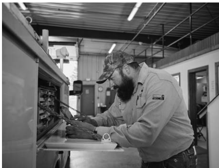
A GCEA lineman reviews information in the outage management program.

Our local communities are brighter, safer, and stronger because of their selfless sacrifices.