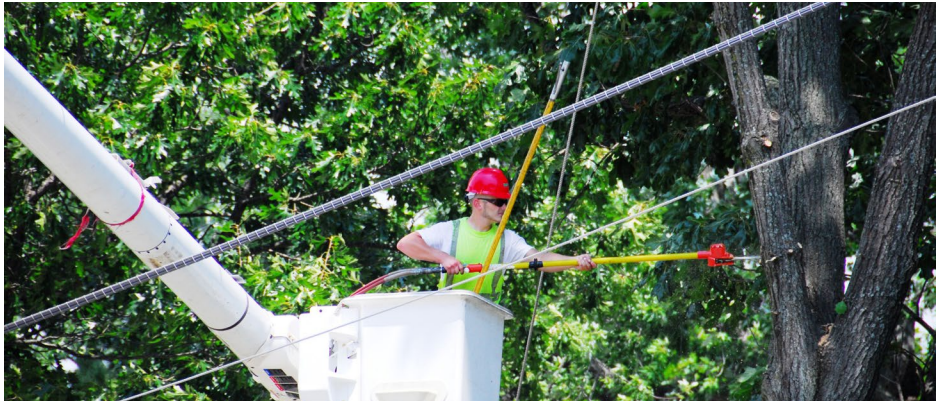
▲ An OSHA certified worker trims a tree near high-voltage lines. Special care must be taken when performing vegetation management near high-voltage power lines. Always keep at least 10 feet away from power lines.