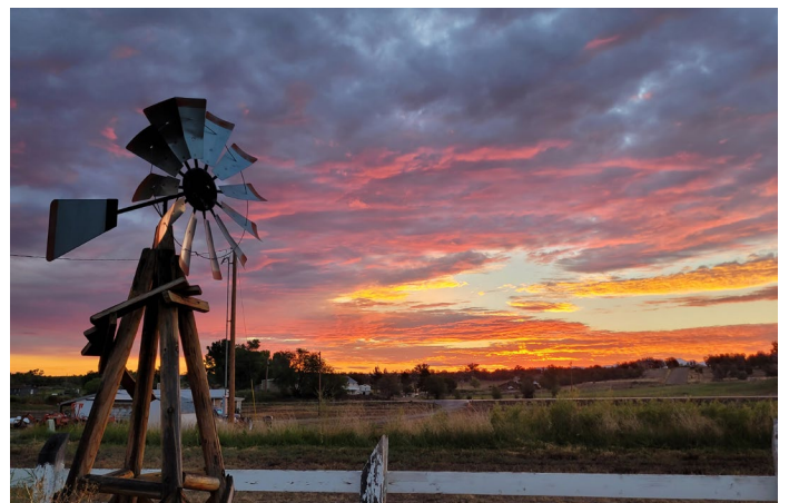
▲ Co-op Photo Contest Winner April 2024 – Windmill in the Sunset by Rebekah Robindale