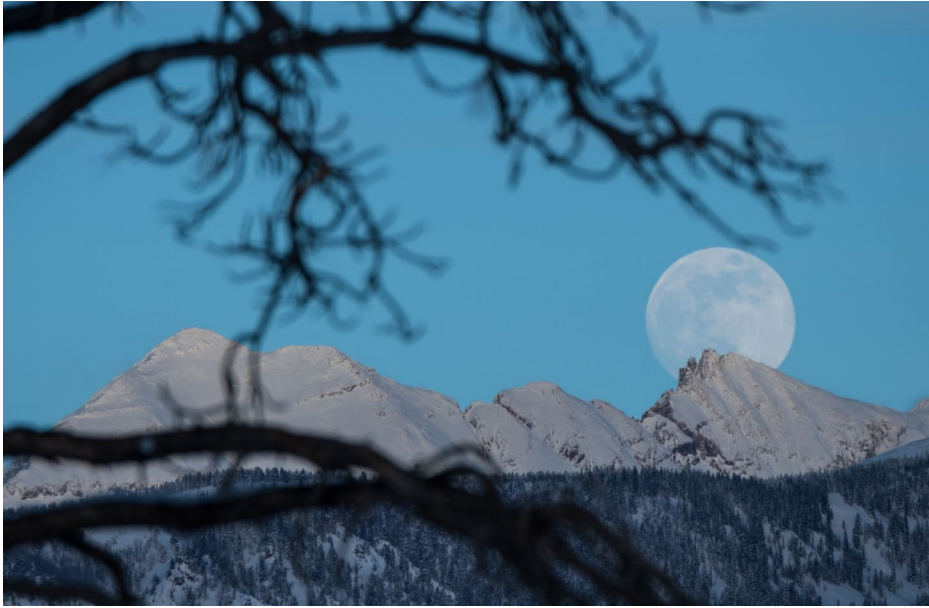
▲ "Moon Rising Over the La Plata Mountains" by Braden Gunem.