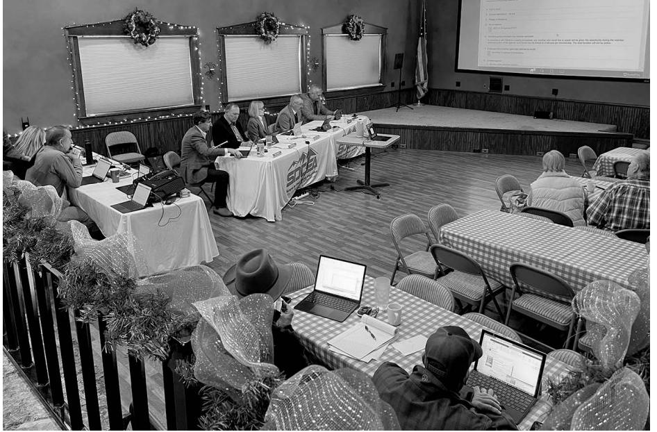
▲ The SDCEA Board of Directors meets with members at Tony's Pizza in Silver Cliff in November.

SDCEA was pleased to have a chance to hold the monthly board meeting and connect with members over lunch in Tony's event room on November 29. Tony's staff, the food, atmosphere, and conversations with our members were top-notch. Thank you to everyone who joined us and made the meeting possible.