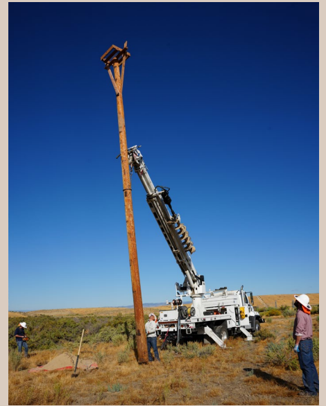
▲ A Grand Valley Power linecrew installs an osprey nesting platform in Highline Lake State Park.