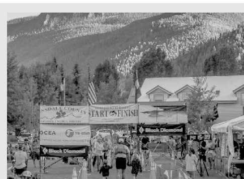
LAKE CITY SAN JUAN SOLSTICE RACE GCEA & Tri-State sponsor the popular San Juan Solstice in Lake City.