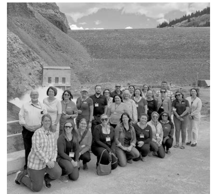
Electric co-op accountants from across Colorado visit the Taylor River Hydro project during the group's conference in August.