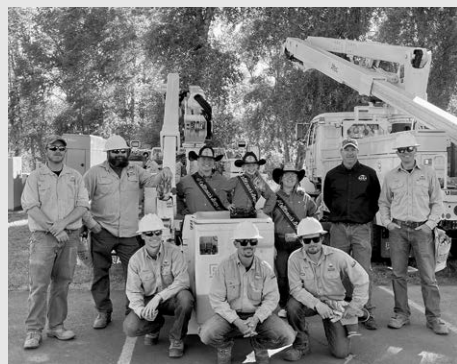
CATTELMEN'S DAYS ROYALTY & RODEO GCEA sponsors the Cattlemen's Days royalty, rodeo, and 4-H livestock sale.