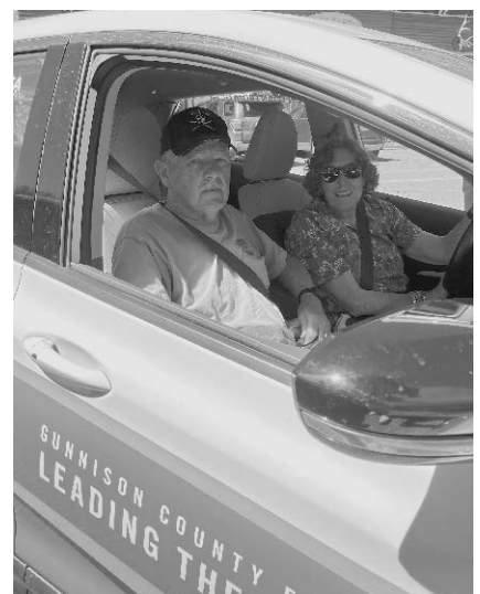
BRATS & KILOWATTS GCEA holds a fun end of summer event — Brats & Kilowatts — in Lake City. GCEA representatives serve bratwurst and connect with members about solar, EVs, and reliability.