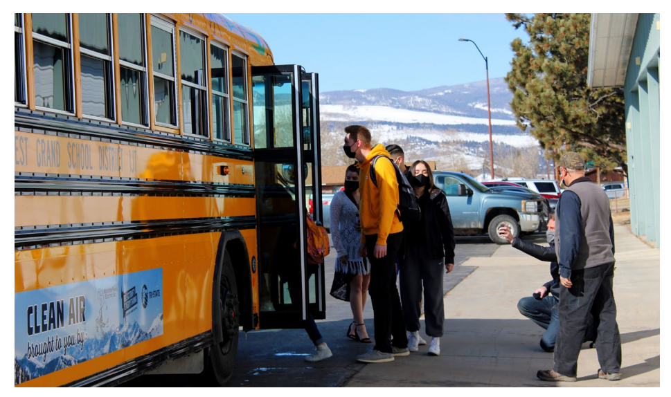
Thanks to MPE and its partners, one of the first electric school buses in the state of Colorado arrives at the West Grand School District in March 2021. The recent "School to Bus to Grid" collaboration plans to build on East Grand School District's recent EPA grants for electric school buses.