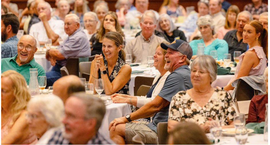
Members share a meal and have a few laughs during the prize portion of the Annual Meeting.

If you missed our wonderful annual meeting, I invite you to watch the 2023 Business Report video on YouTube.