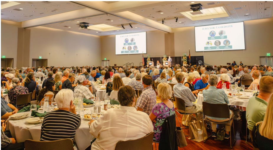
Members listen to GVP’s business report and year in review at the Annual Meeting, held at Colorado Mesa University.