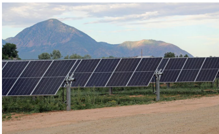
▲ The Montezuma solar generator delivers 5 megawatts of capacity and utilizes single-axis tracking to follow the arc of the sun to maximize energy production. It produces enough energy to supply over 1,600 homes for an entire year.

EEA purchases the bulk of its power supply from Tri-State Generation and Transmission Association, a wholesale electric cooperative that supplies power to rural electric cooperatives in Colorado, Nebraska, New Mexico, and Wyoming. EEA's agreement with Tri-State allows us to purchase up to 5% of our power from renewable generation located in our service area. EEA has reached the 5% threshold allowed.