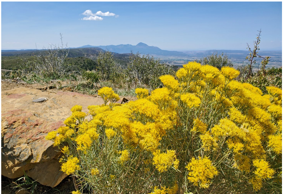
▲ "Rubber Rabbitbrush at Park Point" by Denise Moore.