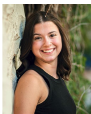
Grazia Novak Berthoud High School