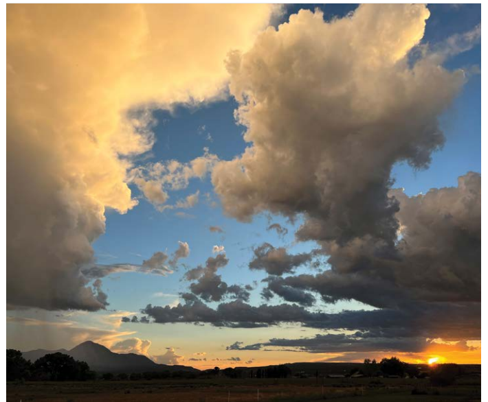
Co-op Photo Contest Winner March 2023 – "Sunset and Ute" by Brian Balfour

Kickback is the single greatest cause of injury to chainsaw users.