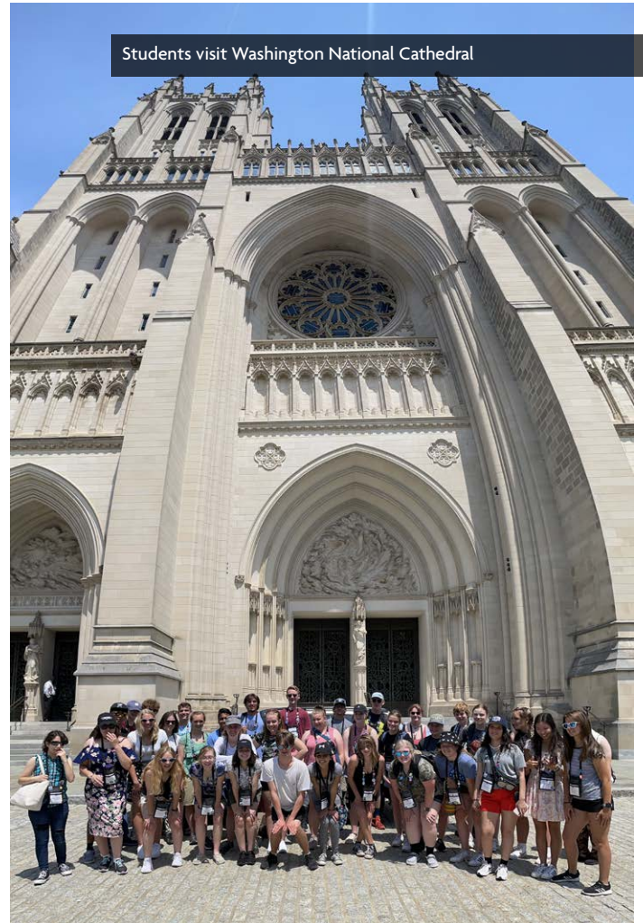
Students visit Washington National Cathedral