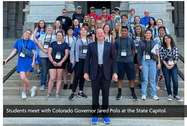
Students meet with Colorado Governor Jared Polis at the State Capitol.