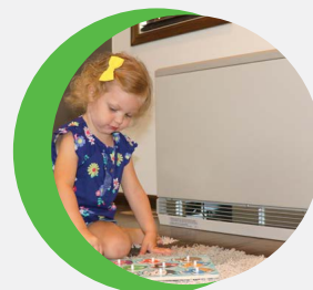
ELECTRIC THERMAL STORAGE HEATERS