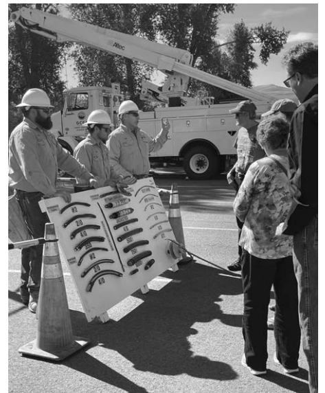
^ GCEA linemen perform a safety demonstration.