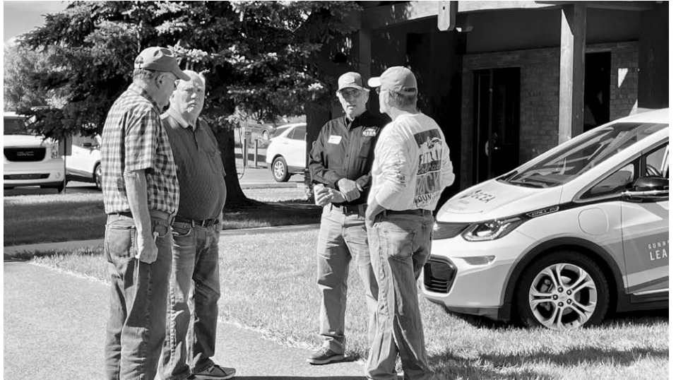
^ Members talk EVs at the annual meeting held at GCEA headquarters.