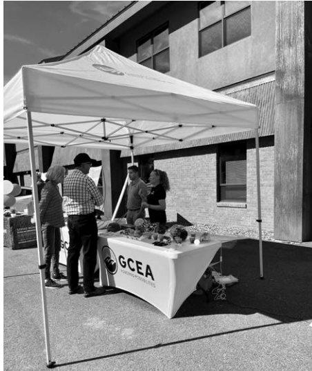
^ GCEA representatives talk to members at the annual meeting on June 21.