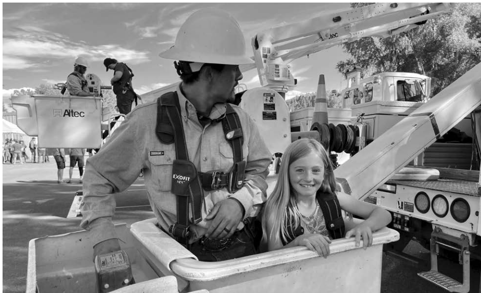
^ A young GCEA member enjoys a ride in a bucket truck at the annual meeting.