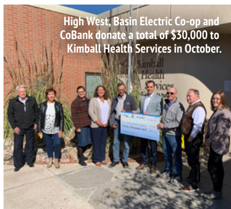
High West, Basin Electric Co-op and CoBank donate a total of $30,000 to Kimball Health Services in October.