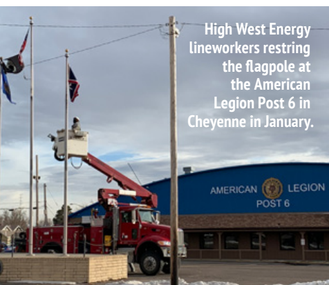
High West Energy lineworkers restring the flagpole at the American Legion Post 6 in Cheyenne in January.