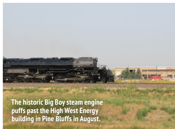
The historic Big Boy steam engine puffs past the High West Energy building in Pine Bluffs in August.