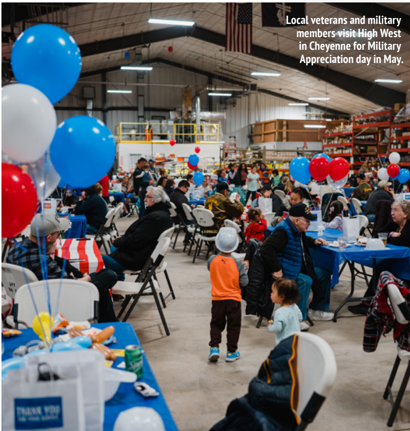
Local veterans and military members visit High West in Cheyenne for Military Appreciation day in May.