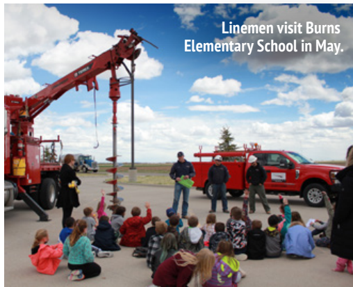
Linemen visit Burns Elementary School in May.