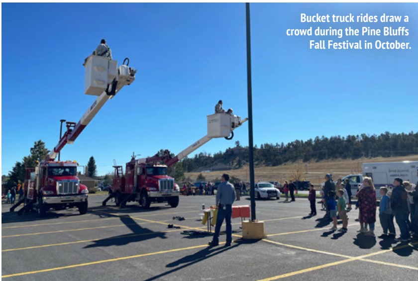
Bucket truck rides draw a crowd during the Pine Bluffs Fall Festival in October.