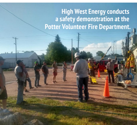
High West Energy conducts a safety demonstration at the Potter Volunteer Fire Department.