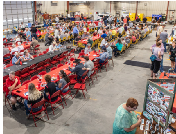
Members return for an annual meeting in June.