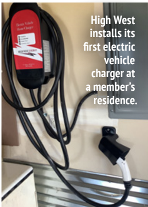
High West installs its first electric vehicle charger at a member's residence.