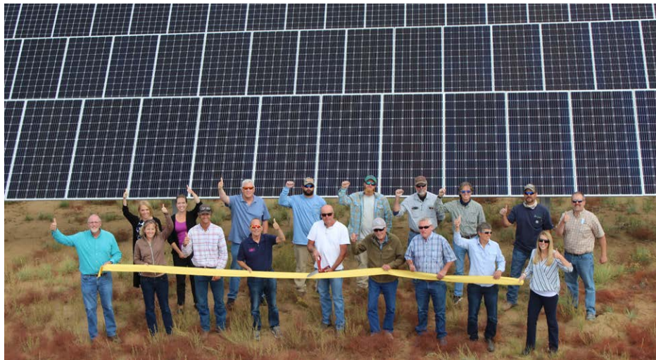
▲ MPE's Whiskey Hill Solar Array ribbon cutting ceremony, September 16, 2021. In 2020, in its first full year of production, the 1-Megawatt array generated 2.4 million kilowatt-hours, enough to power approximately 300 homes.