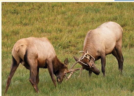
◀ "Bull Elk Battle," by Alyson Palma

Submit your wildlife photos and enter the CCL photo contest at coloradocountrylife.coop/2022-photo-contest .