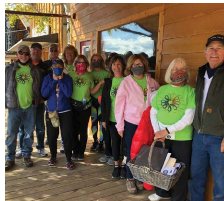
2020 Taking Steps for Cancer volunteers

Community residents are eligible for up to $3,500 each year for costs associated with preventive screenings, mileage (for appointments or treatment), hotel stays,