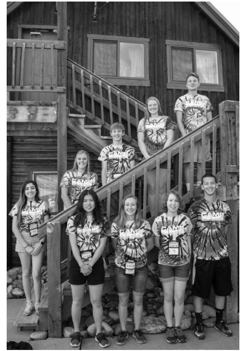
▲ Students from four states get acquainted at Leadership Camp.