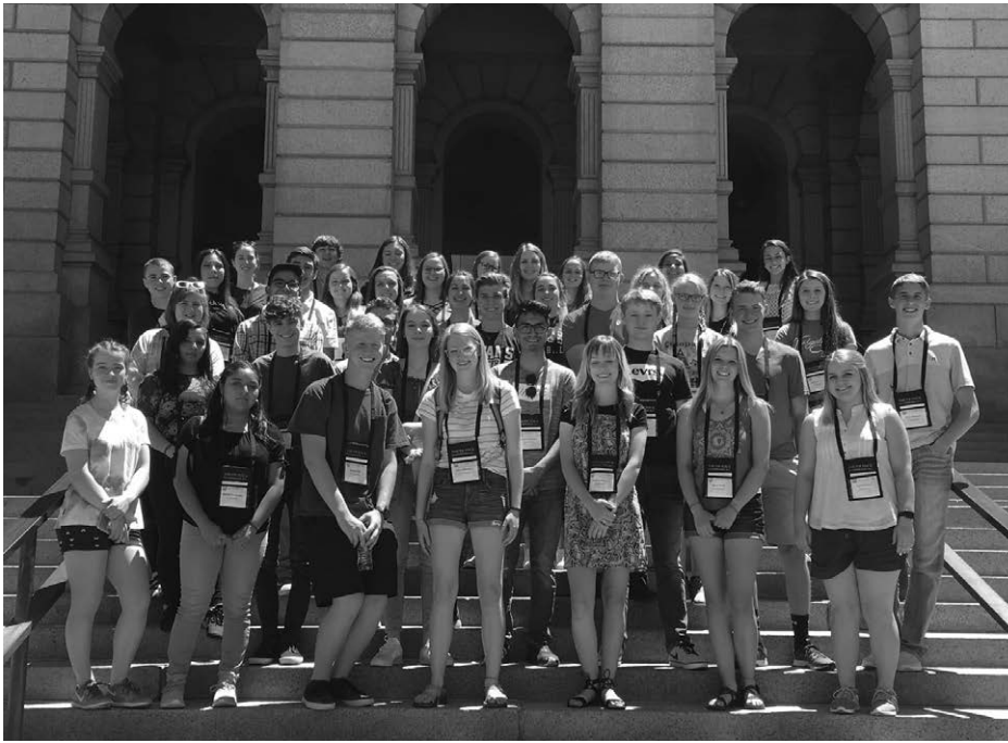
▲ Colorado students visit the Colorado State Capitol before heading to Washington, D.C.