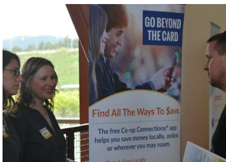
The information booths included onsite registration for the Co-op Connections® program.

Presentation slides from the Annual Meeting are available by visiting www.mvea.coop/annual-meeting . Thank you to all who helped to make this meeting a success! Mark your calendars! MVEA's 79th Annual Meeting of Members will be held June 4, 2020 in Falcon.