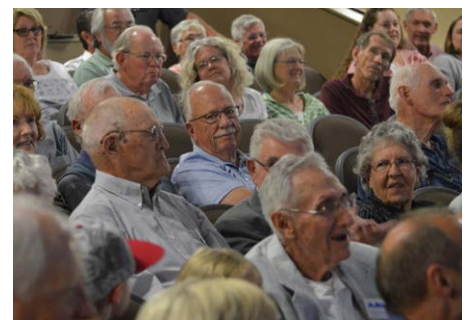
There wasn't a bad seat in the house at the Palmer Ridge High School auditorium.