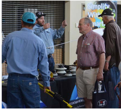
The MVEA lineworker's gear table was a crowd favorite.