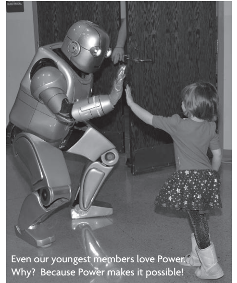
Even our youngest members love Power. Why? Because Power makes it possible!