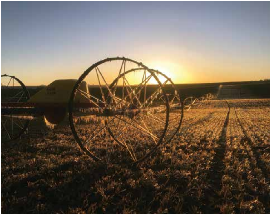
Spring Morning Ice by Allison Porter